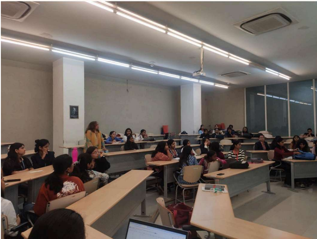
Providing Counselling Support to the cases given