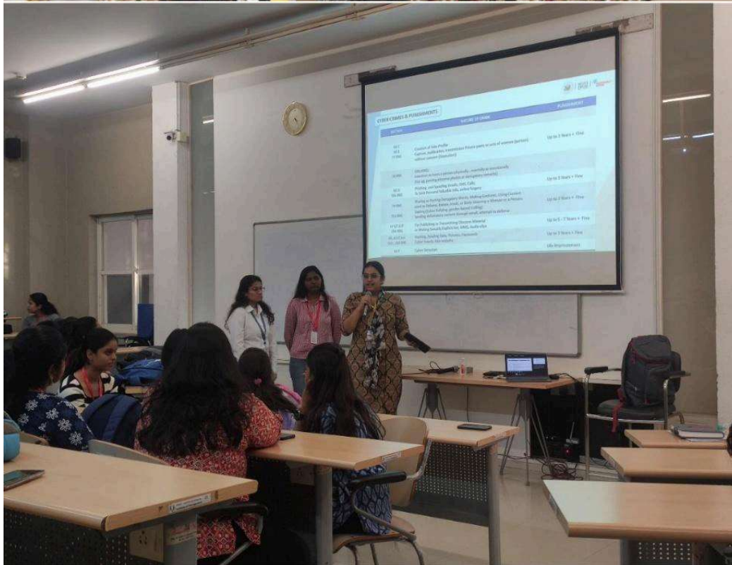
Addressing technical support to the case given