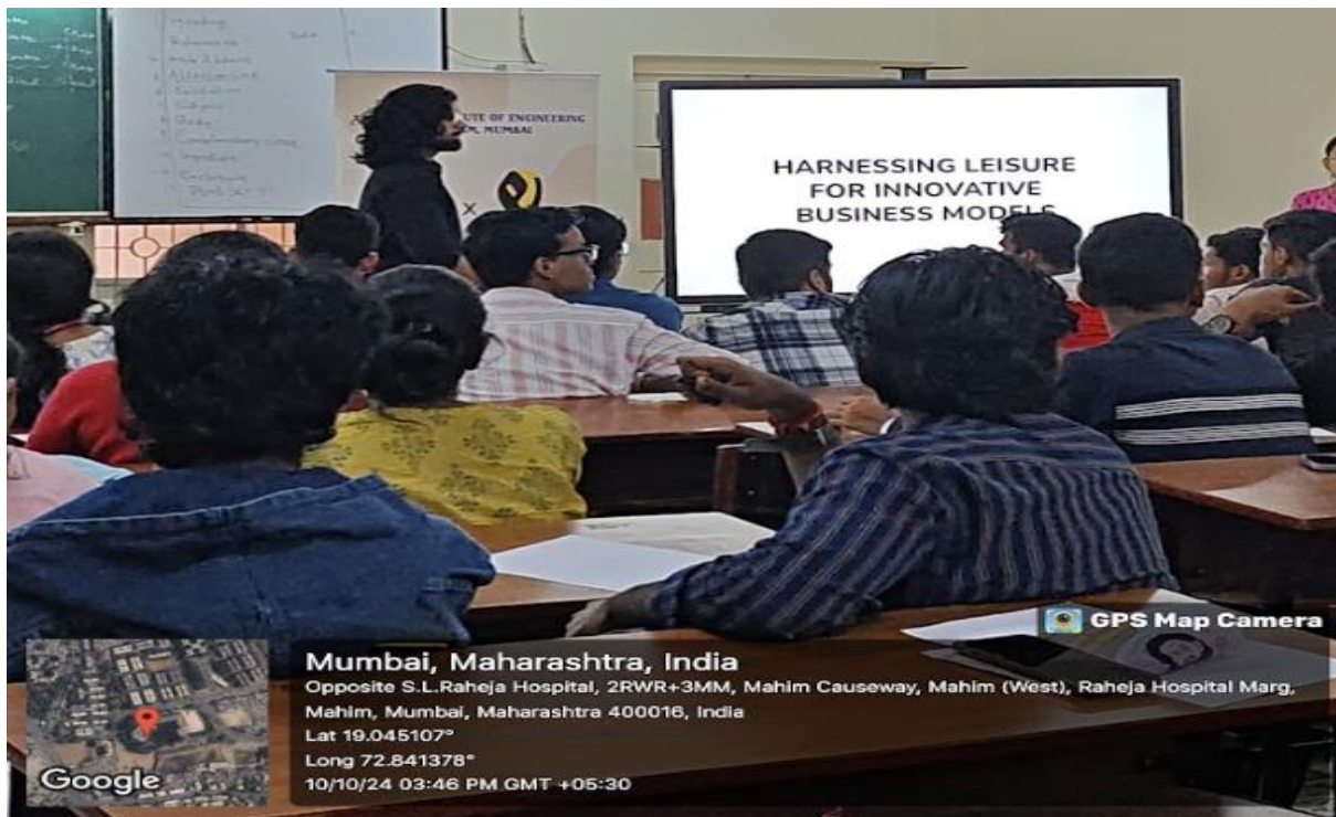
Glimpse of the event: Harnessing Leisure for Innovative Business Models