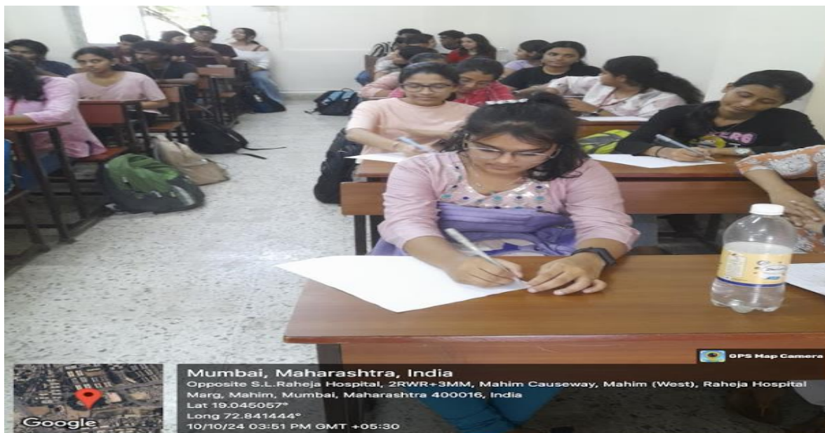
Activities conducted during the event: Harnessing Leisure for Innovative Business Models