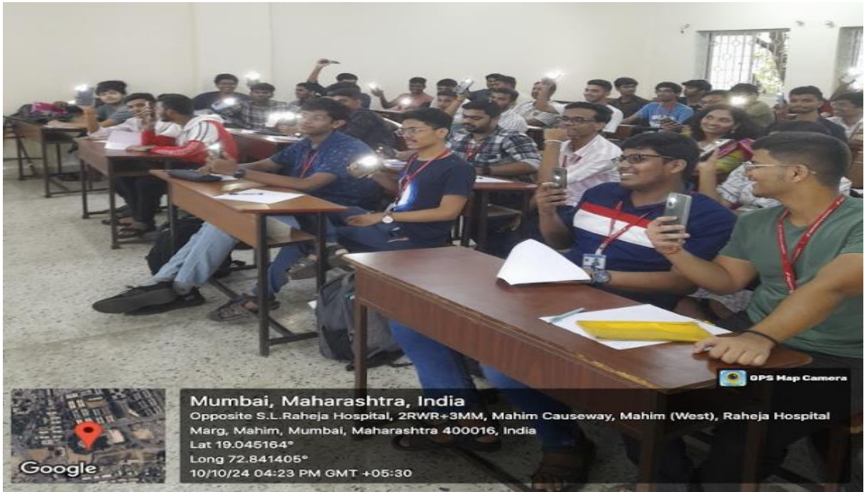
Activities conducted during the event: Harnessing Leisure for Innovative Business Models